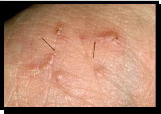
Classic Scabies with burrows

The scabies rash is often described as raised red bumps, similar to pimples; in some cases the mite burrows may look like a crooked, raised rash or crusting.