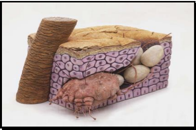
Scabies mite burrowing in skin and laying eggs

Scabies is caused by an infestation of the human itch mite Sarcoptes scabiei that burrows into the upper layer of the human skin where it hatches eggs and reproduces. If you have scabies, you might have a rash and be very itchy.