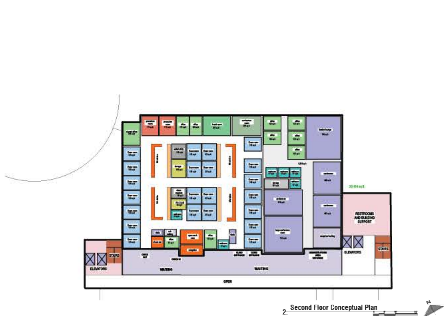
2 Second Floor Conceptual Plan