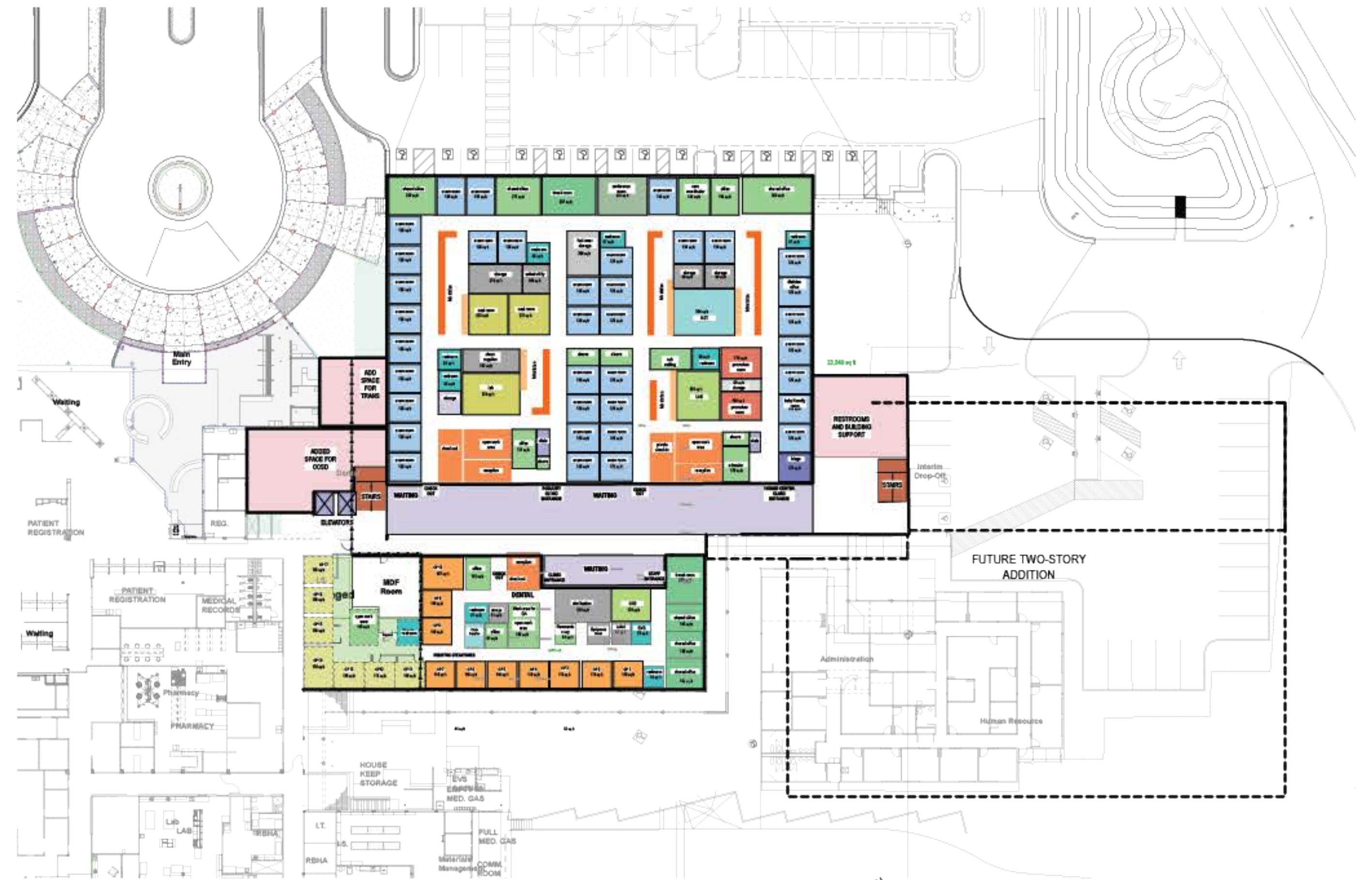
Conceptual Floor Plan - Concept No. 1 Revision 2